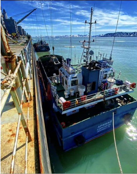
TIG 500t barge unloading

TIG has successfully started the 2020 shipping season – the first season in which TIG fully manages all port activities. Preparations for the season included extensive dredging works, bringing and training over 70 port personnel to Beringovsky, repair works on apartments and other housing and lodging arrangements, maintenance of the coal loading system, repair works on our fleet and obtaining all necessary licenses and approvals.