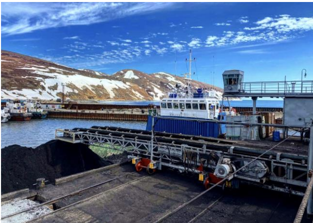
Belt conveyor loading of TIG's 500t barge

During June, TIG loaded 159kt with an average daily loading rate of 8.3kt per workable weather day and maximum achieved loading rate of 9kt per day. TIG shipped three cargos of thermal coal during June and one cargo with thermal coal in July. On 21 of July TIG completed loading the fifth cargo with semi-soft coking coal. Transshipment is performed with TIG’s four 500-tonne barges.